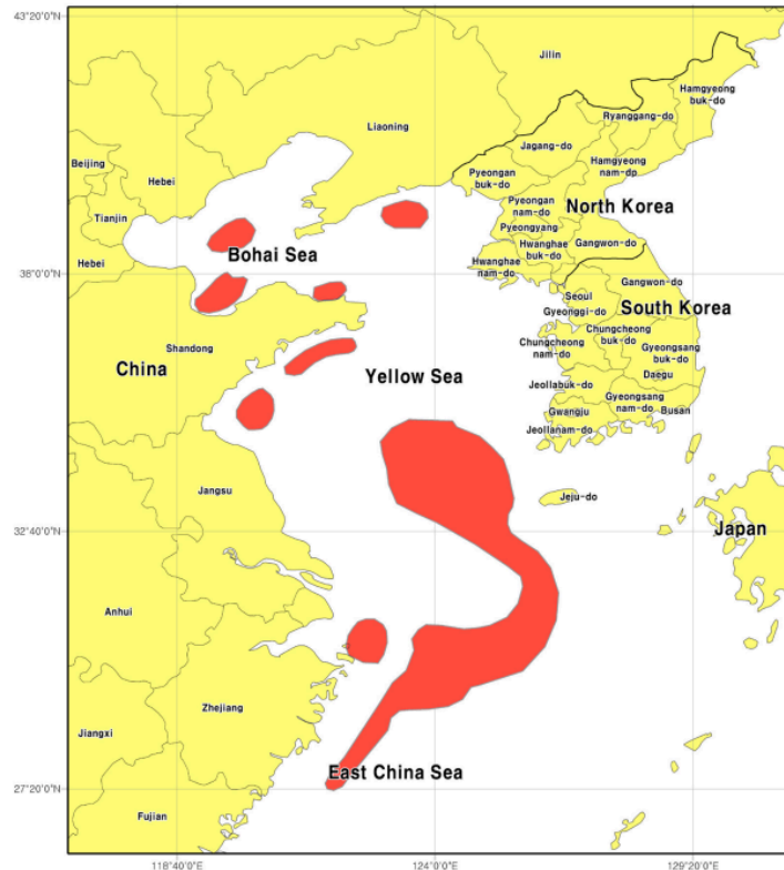
Figure 1. Distribution of Japanese anchovy in Chinese waters 3